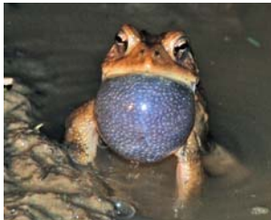
Trilling for a mate!

We are in the midst of a busy spring which is rapidly racing towards summer. School classes are winding down and summer camp is on the horizon.